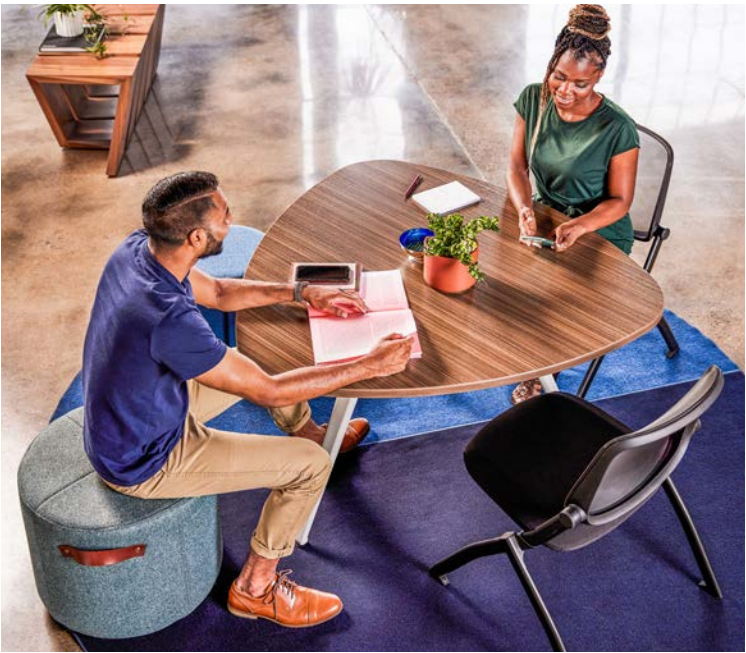
Products shown EverySpace® by Kimball Chaddy™ by National Joelle™ by Kimball Looper™ by Kimball (David Edward Collection)

Socializing supports positive mental health. With digital device usage at an all-time high, sometimes personal interactions are skipped and opportunities are missed.