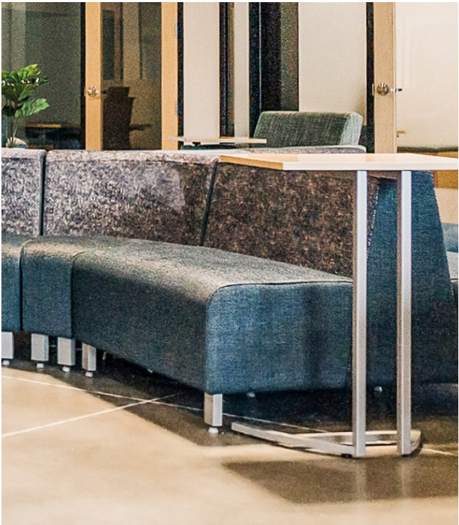
Products shown Kozmic™ by National Universal Pull-Up Table by National

Today's library spaces encompass much more than books. From project-based learning to individualized lessons, these environments need to accommodate a spectrum of activities.