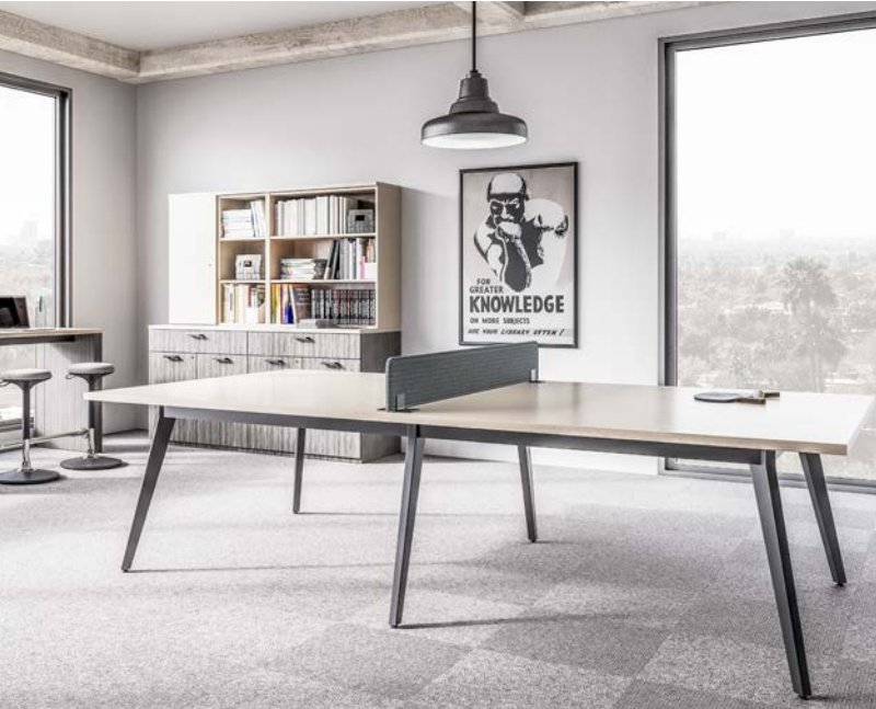
Products shown Tessera® by National WaveWorks® by National Weitz™ by National Strassa® by National

Creativity-inducing spaces offer hands-on activities that engage the mind and offer an opportunity to reduce stress. These dynamic spaces provide a location to relax and connect or a comfortable niche to be alone while still among others.