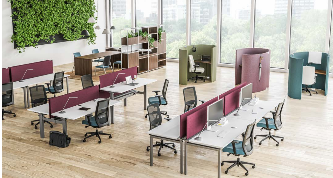
Products shown Alloy™ by National, Whirl® by National, Eklund™ by National, Strassa® by National, Lochlyn® by National

Functional and flexible solutions create spaces for focused work, shared activities, and the exchange of ideas.