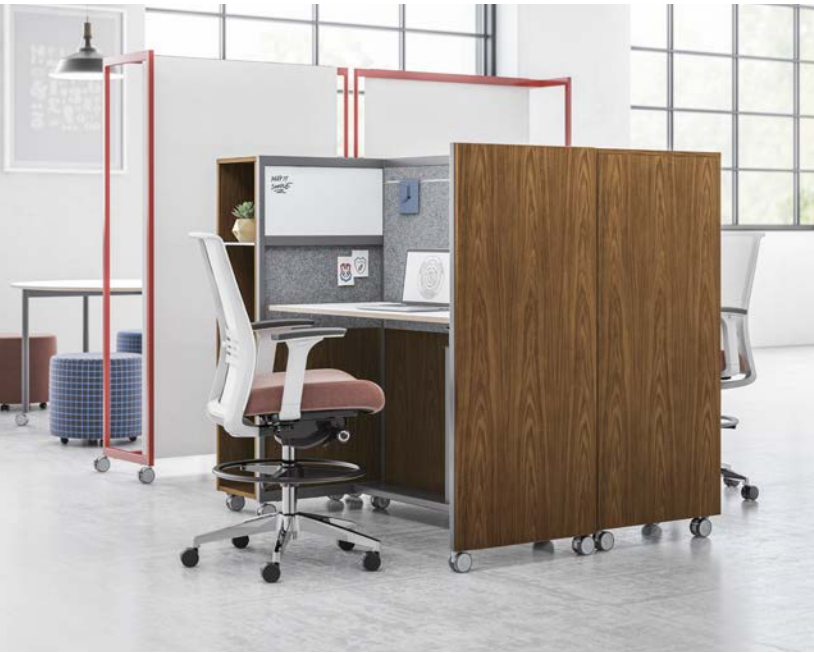
Products shown KORE® by Kimball Joya™ by Kimball Joelle™ by Kimball

Within common as well as open concept areas, focus spaces create private coves for heads down time. Offering visual privacy and providing a distraction-free spot, these nooks are essential to student success.