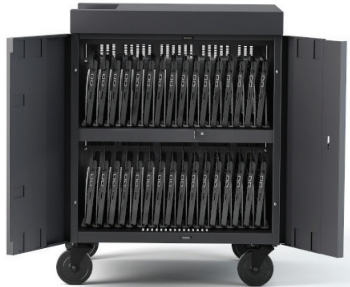
CUBE Cart® Pre-Wired shown in Charcoal (CK)